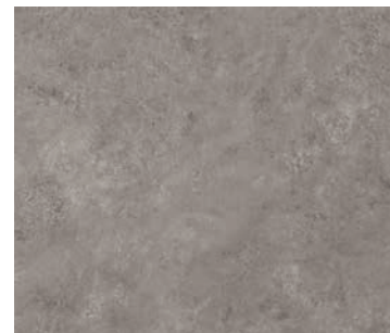
Ash Stone JPT4968TC