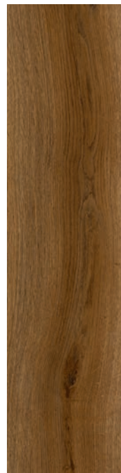
Umber Oak JPT1866TC