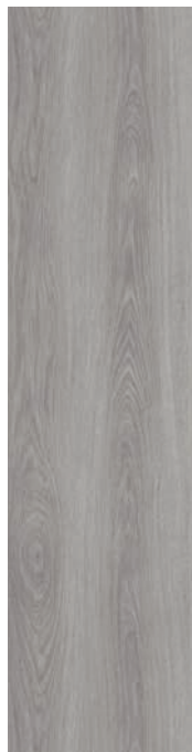
Fog Oak JPT1952TC