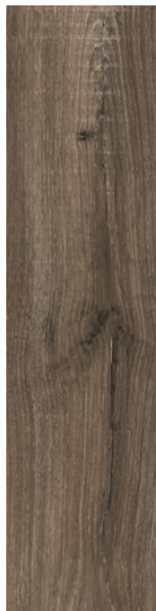
Nest Oak JPT2870TC