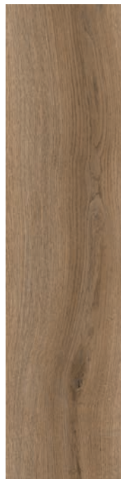
Straw Oak JPT1826TC