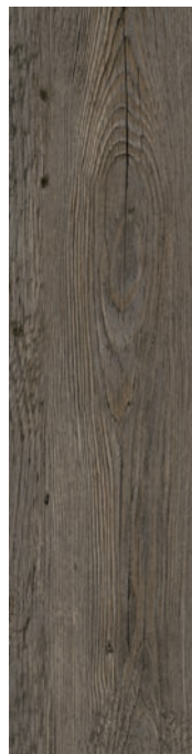
Iron Oak JPT2965TC