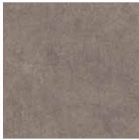
arteo VTX16926592 Pattern Repeat L100 x W99.5