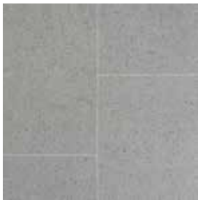
arena VTX17226509 Pattern Repeat L100 x W99.5 Drop 1/3