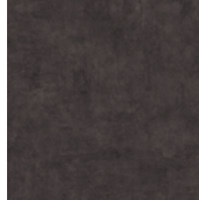
odin VTX17026596 Pattern Repeat L100 x W99.5 Reverse Lay