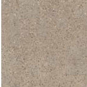
sorento VTX20526582 Pattern Repeat L100 x W99.5 Reverse Lay