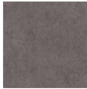
arteo VTX16926594 Pattern Repeat L100 x W99.5