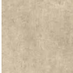
pinnacles VTX19526532 Pattern Repeat L100 x W100 Drop 1/2 Reverse Lay