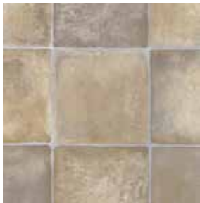
palermo VTX5626936 Pattern Repeat L100 x W100 Drop 1/5