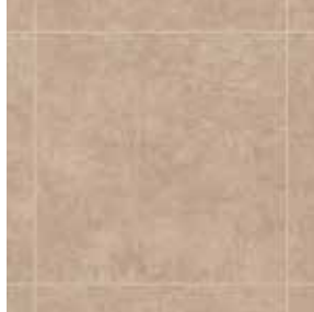
marsala VTX16526532 Pattern Repeat L120 x W119.4 Drop 2/3