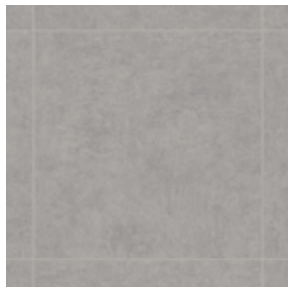
marsala VTX16526592 Pattern Repeat L120 x W119.4 Drop 2/3