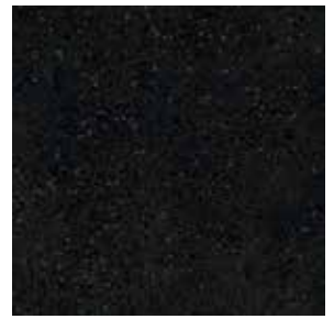
sorento VTX20526599 Pattern Repeat L100 x W99.5 Reverse Lay