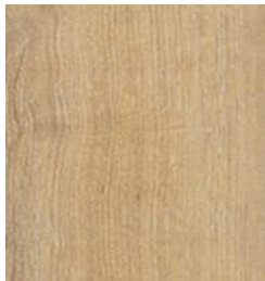
520 Brass Oak