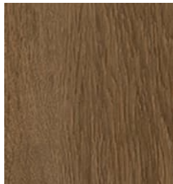
560 Burl Oak