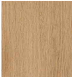
300 Sable Oak