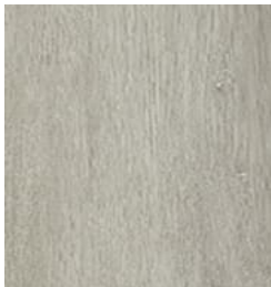
700 Platinum Grey