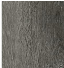
790 Silhouette Oak