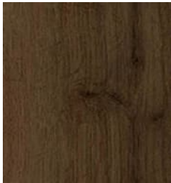
180 Burnt Umber