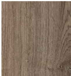
580 Fallow Oak