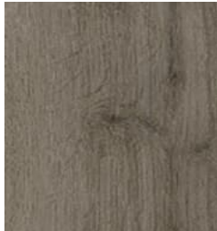
720 Pepper Oak