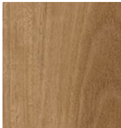
555 Marble Spotted Gum