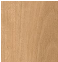
545 Apple-Box Gum